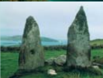
MARRIAGE STONE AT CAPE CLEAR ISLAND