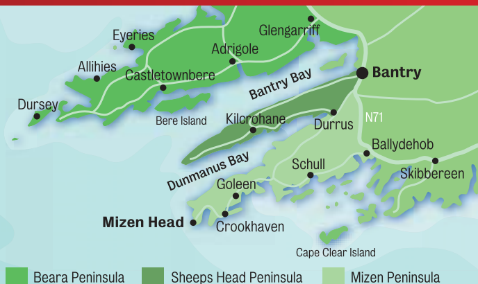
■ Beara Peninsula ■ Sheeps Head Peninsula ■ Mizen Peninsula

SKIBBEREEN - market town with colourful shops & pubs. Approx. 45m (72 kms) round trip from Bantry